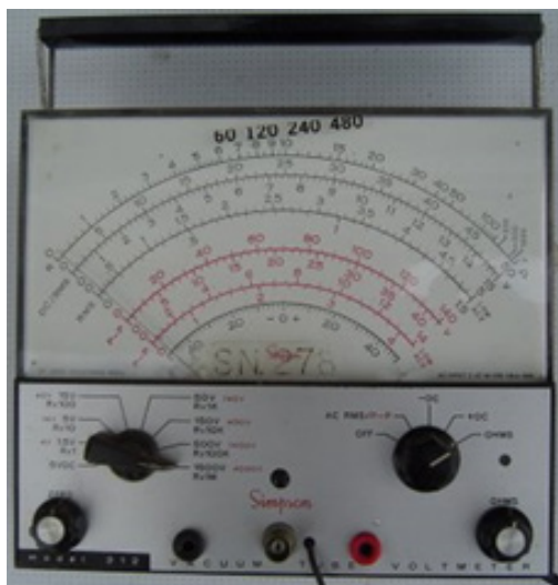
Illustration of a typical vacuum tube voltmeter. Please note that the values increase to the right and diminish toward the left in an opposite way to conventional analogue multimeters. To the far right is the maximum value of 1,000 million Ohm shown.