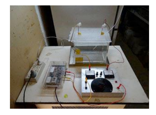
Figure 1: This show the entire set-up, i.e. The 300 Volts DC @ 50 micro ampere (limited) power supply unit to the left, the actual measuring instrument at the bottom right and a 10 litre tank filled with 9 litres of deionised water and containing two pure silver electrodes at the rear.

Both the electrodes in the tank as well as the potentiometer have the power supply in common and each a panel meter is in series connected. When power is applied to both systems it is likely to draw more current as compared to the other with less current. However by adjusting the variable resistor, a point is reached when the current through both system is equal and both panel meters show a half scale deflection at 25 micro ampere each. The resistance in this particular instance was 170,000 Ohm, just as the thought experiment had predicted. The water thus represents a resistance of 170,000 Ohm to the current flowing through it. Below is a picture of the experimental set-up and a composite picture of the comparisons between the settings of the parallel resistance factor: